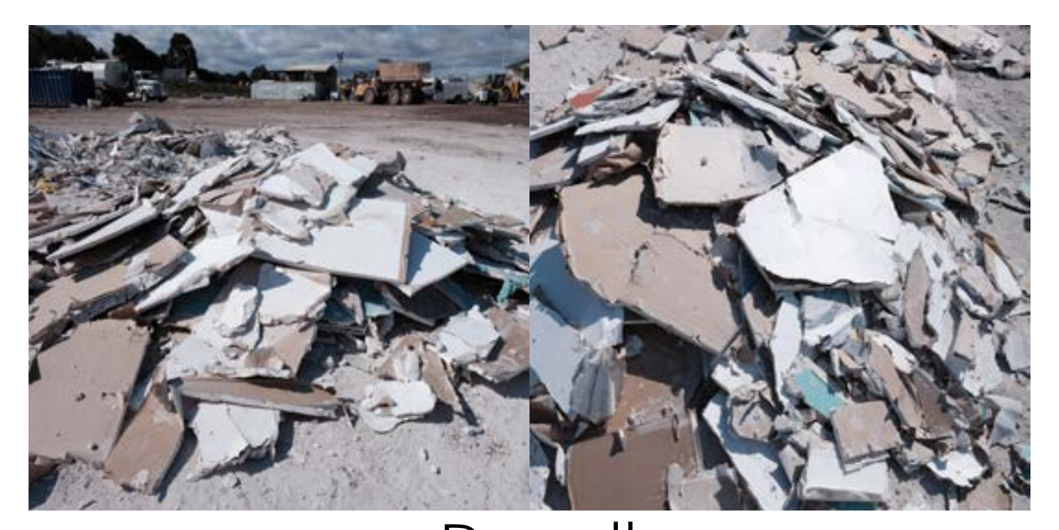
Drywall Site 2: Sheetrock Recycling