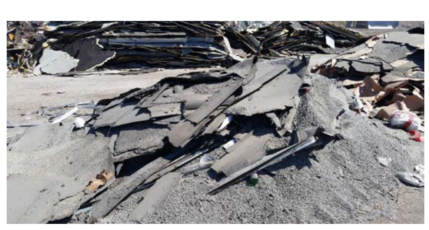
To return to the table of contents, click the logo .

Roofing materials containing roofing felt or paper, tar and assorted gravel materials.