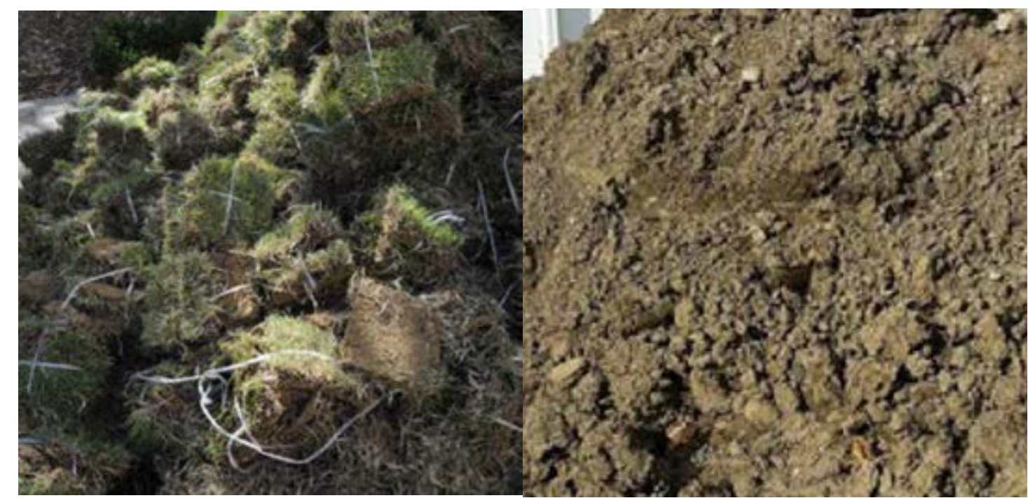
Clean Fill Dirt/Sod