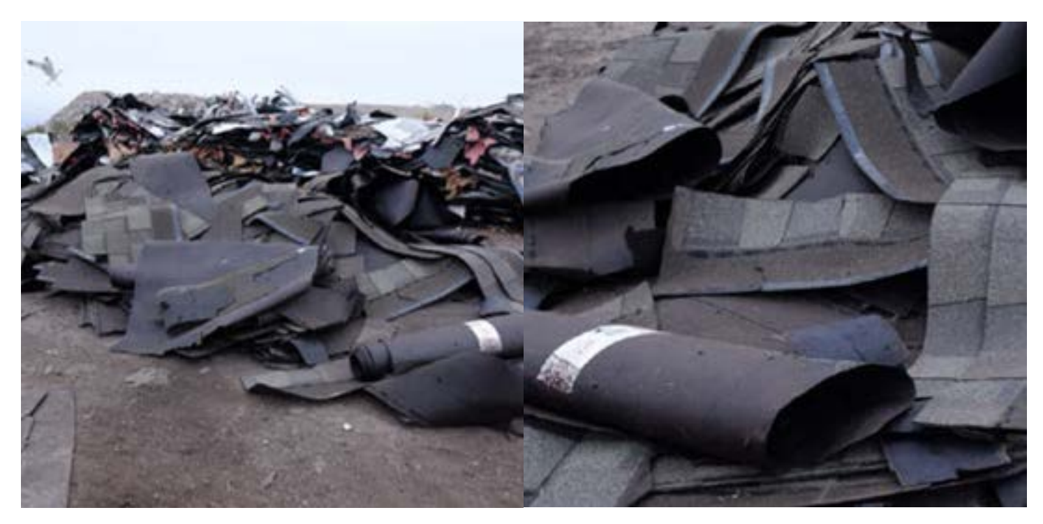
Composite Asphalt Roofing Site 1: Asphalt Shingle Recycling

Source separated residential roofing shingles. Does not include tar and gravel roofing or commercial roofing tear-offs. If wood, metals, or bags are commingled in the load, the load will be considered COMPOSITE ASPHALT ROOFING-MIXED.