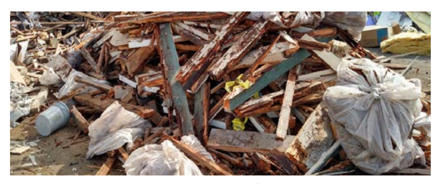
To return to the table of contents, click the logo.

NON- RECYCLABLE ITEMS (TRASH) may include pressure-treated wood, laminated wood, painted wood, sawdust, insulation, PVC pipes, film plastics and other packing materials, asphalt roofing, roofing felt, roofing insulation, fiberglass insulation, vinyl flooring, ceiling tiles, stucco, soil, asphalt, windows, doors, carpeting, carpet padding, furniture, cabinets, sinks, furniture and Styrofoam, crushed materials, mattresses, rubber tiles, ground rubber materials, textiles and linen, couches, chairs, desks, office partitions, signs, foam board, cabinets, wet materials, Visqueen, composite type materials and or materials contained in trash bags.