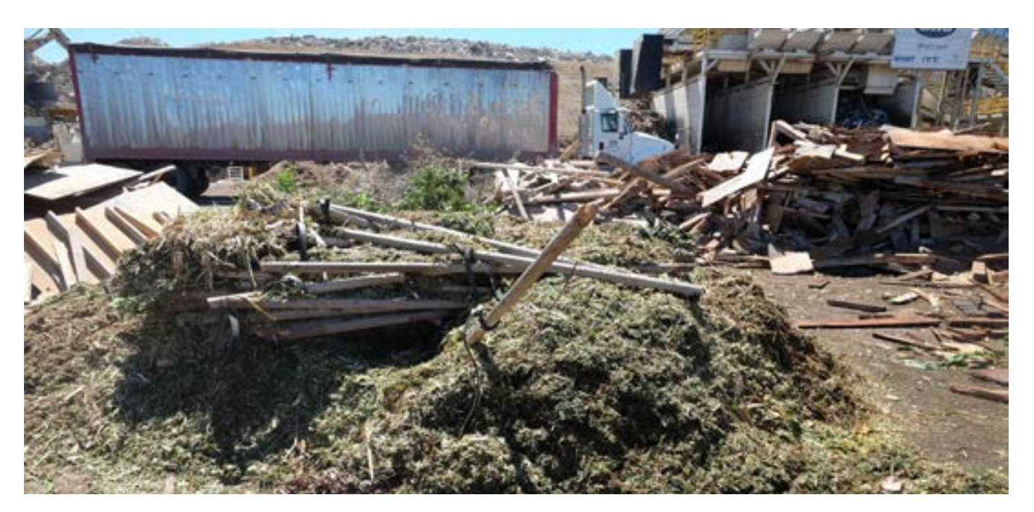
To return to the table of contents, click the logo.

Tree chips that contain lumber, chipped palm, or other fibrous materials. Loads cannot contain TRASH. Pressure treated tree stakes not accepted.