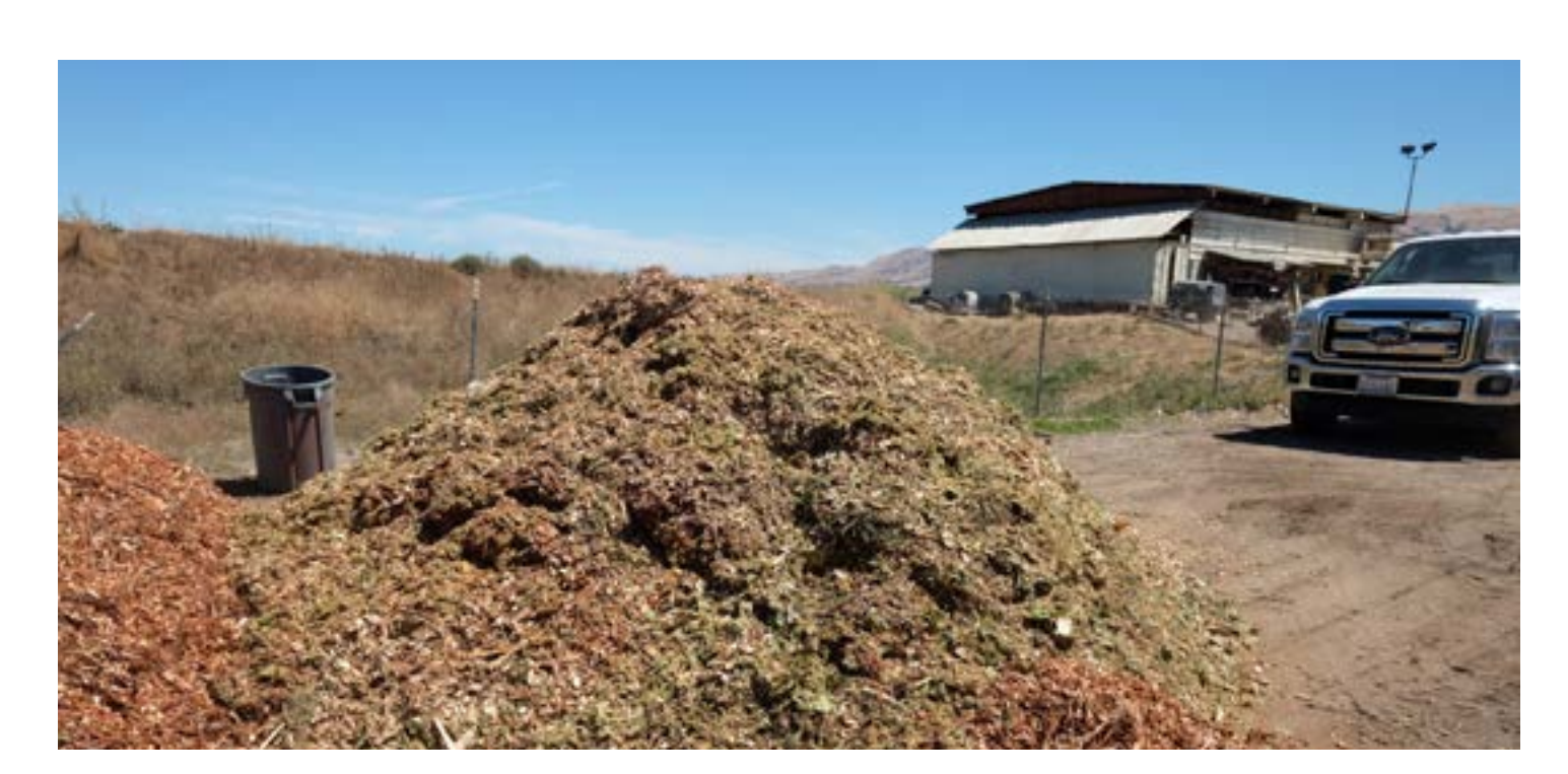
To return to the table of contents, click the logo.

Tree chips are produced from chipped tree trimmings and may contain a few small tree rounds. No fibrous materials.