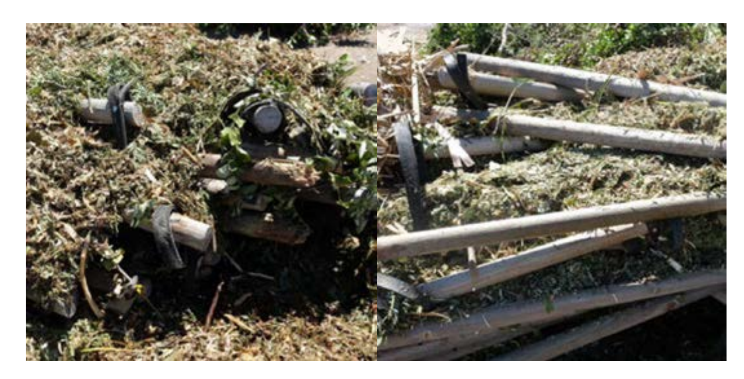
Tree Chips - Mixed Site 1: Wood Recycling Operation

Tree chips that contain lumber, chipped palm, or other fibrous materials. Loads cannot contain TRASH. Pressure treated tree stakes not accepted.