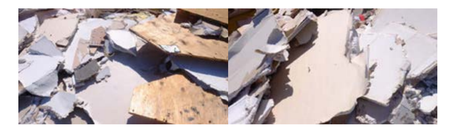
Drywall - Mixed Site 2: Sheetrock Recycling

Sheetrock that contains nominal amounts of other items such as Visqueen, ceiling tiles, wood or other debris. These loads are normally generated during new construction, not by demolition.