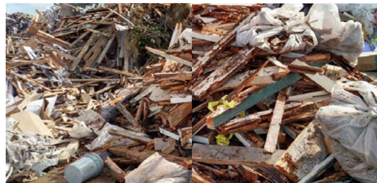
Trash Site 1/2

Materials that are tipped directly into the outgoing trash pile.