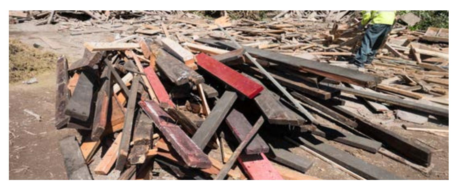
To return to the table of contents, click the logo .

NON- RECYCLABLE ITEMS (TRASH) may include pressure-treated wood, laminated wood, painted wood, sawdust, insulation, PVC pipes, film plastics and other packing materials, asphalt roofing, roofing felt, roofing insulation, fiberglass insulation, vinyl flooring, ceiling tiles, stucco, soil, asphalt, windows, doors, carpeting, carpet padding, furniture, cabinets, sinks, furniture and Styrofoam, crushed materials, mattresses, rubber tiles, ground rubber materials, textiles and linen, couches, chairs, desks, office partitions, signs, foam board, cabinets, wet materials, Visqueen, composite type materials and or materials contained in trash bags.