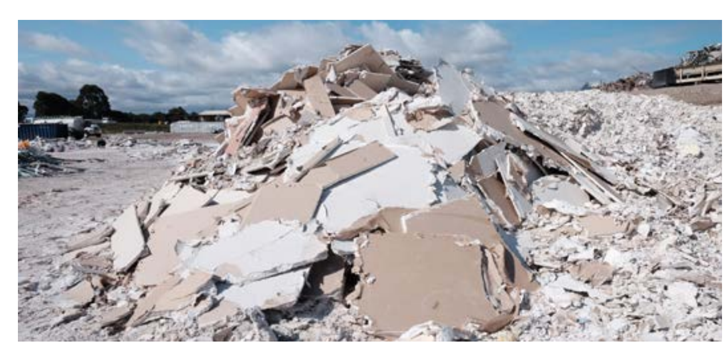
To return to the table of contents, click the logo.