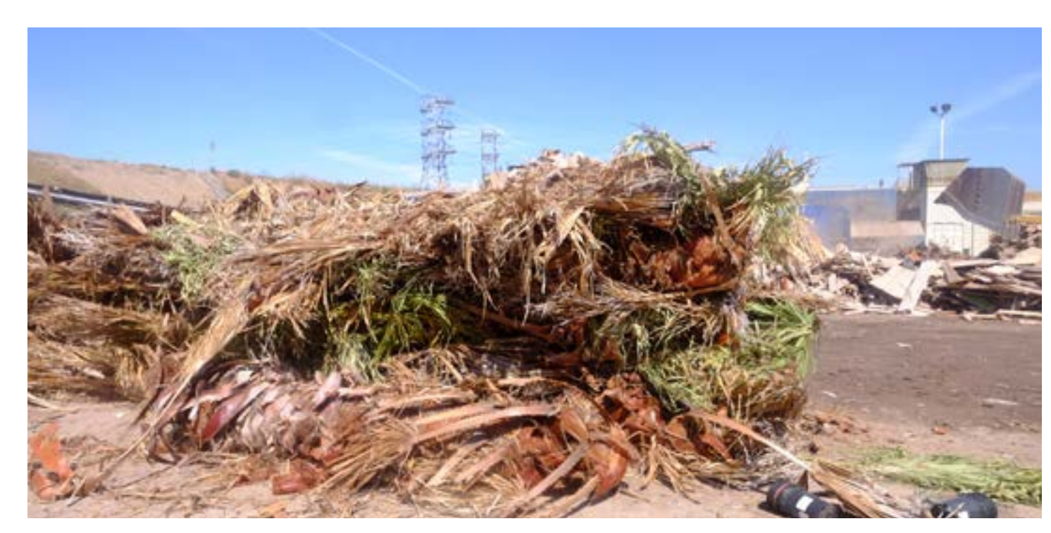
To return to the table of contents, click the logo.

These items will not be processed. They will be classified as TRASH.