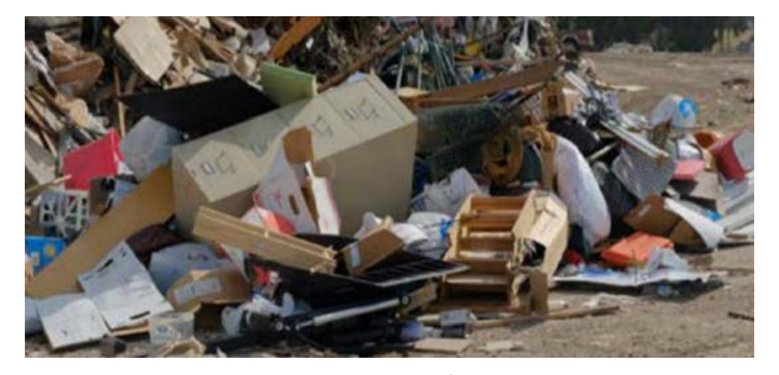
To return to the table of contents, click the logo .

Miscellaneous debris contains a low volume of recyclable commodities. This classification would be considered TRASH at any other C&D recycling facility.