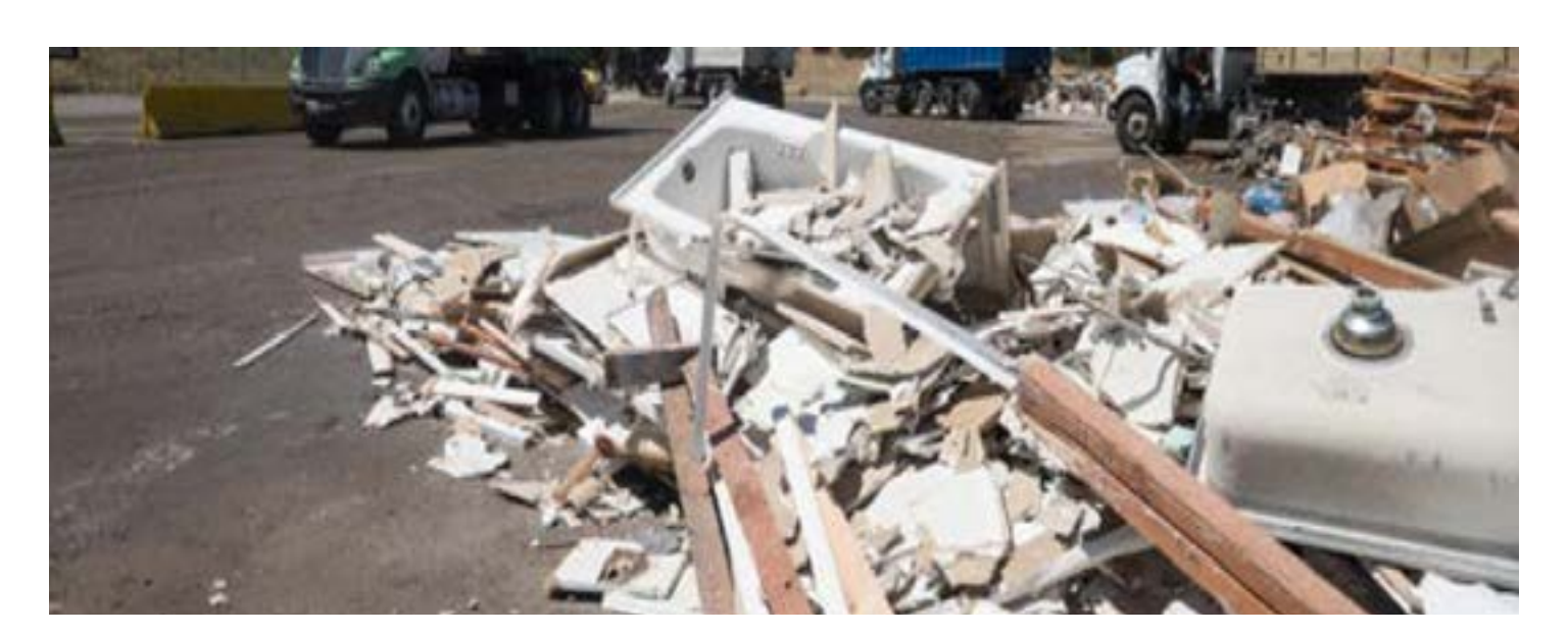
To return to the table of contents, click the logo .

NON- RECYCLABLE ITEMS (TRASH) may include pressure-treated wood, laminated wood, painted wood, sawdust, insulation, PVC pipes, film plastics and other packing materials, asphalt roofing, roofing felt, roofing insulation, fiberglass insulation, vinyl flooring, ceiling tiles, stucco, soil, asphalt, windows, doors, carpeting, carpet padding, furniture, cabinets, sinks, furniture and Styrofoam, crushed materials, mattresses, rubber tiles, ground rubber materials, textiles and linen, couches, chairs, desks, office partitions, signs, foam board, cabinets, wet materials, Visqueen, composite type materials and or materials contained in trash bags.