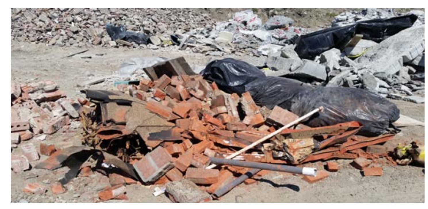
To return to the table of contents, click the logo.

Any load that resembles the images below will be charged as TRASH. Materials will be classified as NON-RECYCLABLE ITEMS (TRASH) if Stucco/Plaster materials are bagged. Excessive trash, wood, etc. in the loads will deem the entire load as TRASH.