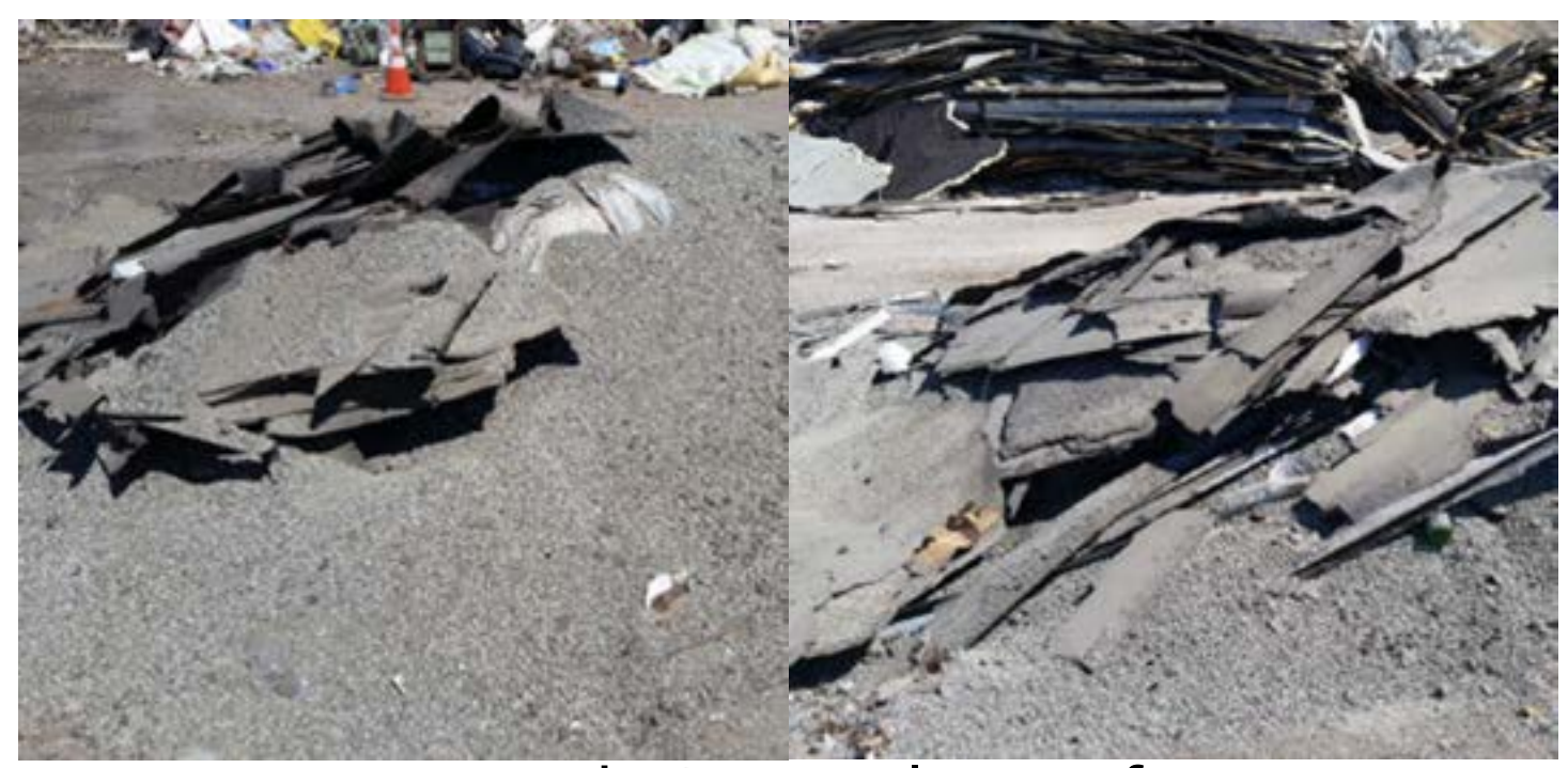
Tar and Gravel Roofing Site 1: Asphalt Shingle Recycling

Roofing materials containing roofing felt or paper, tar and assorted gravel materials.