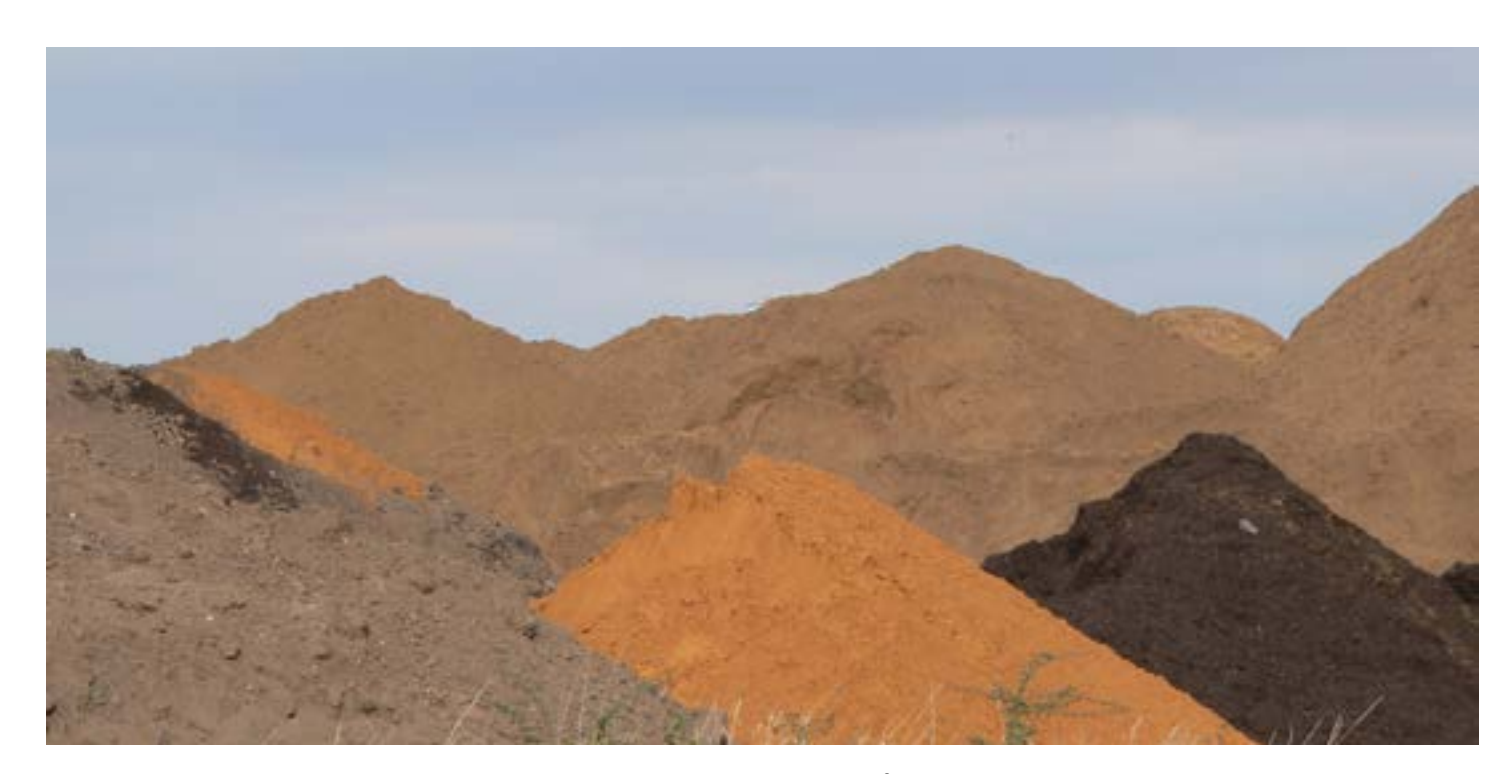
To return to the table of contents, click the logo .

Dirt and sod. All loads over 8 cubic yards are charged by the ton automatically.