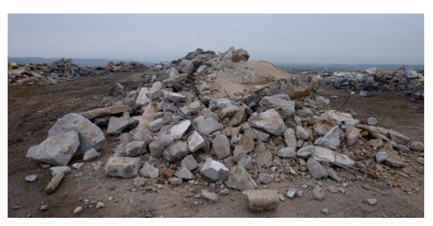
To return to the table of contents, click the logo .

Concrete and asphalt containing some wire or rebar and a small amount of dirt or base rock. No brick, roofing tiles, wood, or trash. Concrete over 3'x3'x3' will be charged as OVERSIZED.