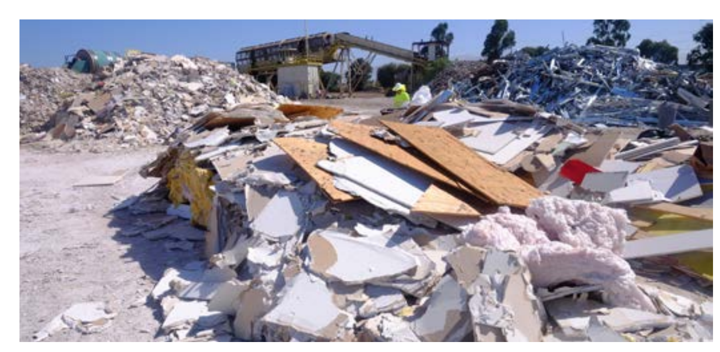
To return to the table of contents, click the logo.

May be classified as TRASH or MISCELLANEOUS DEBRIS if containing excessive amounts of TRASH. NON- RECYCLABLE ITEMS (TRASH) may include pressure-treated wood, laminated wood, painted wood, sawdust, insulation, PVC pipes, film plastics and other packing materials, asphalt roofing, roofing felt, roofing insulation, fiberglass insulation, vinyl flooring, ceiling tiles, stucco, soil, asphalt, windows, doors, carpeting, carpet padding, furniture, cabinets, sinks, furniture and Styrofoam, crushed materials, mattresses, rubber tiles, ground rubber materials, textiles and linen, couches, chairs, desks, office partitions, signs, foam board, cabinets, wet materials, Visqueen, composite type materials and or materials contained in trash bags.