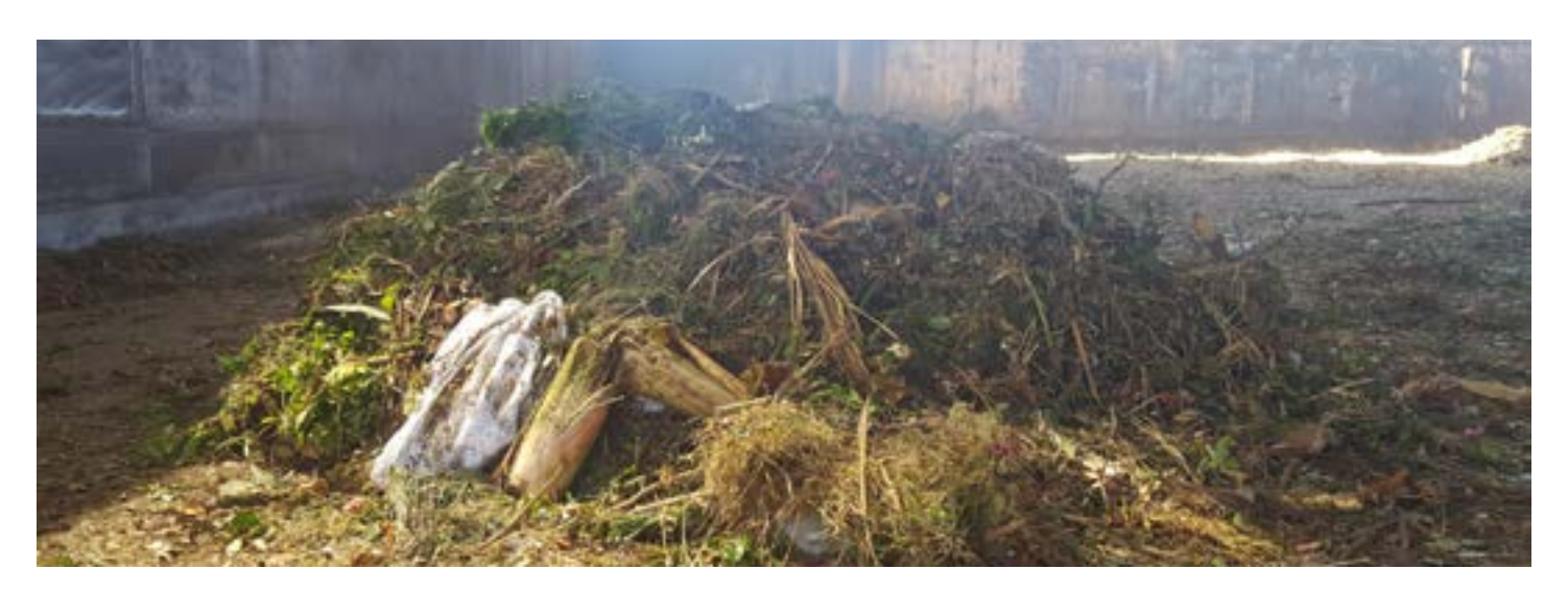
To return to the table of contents, click the logo .

May be classified as TRASH or MISCELLANEOUS DEBRIS if containing excessive amounts of trash. NON- RECYCLABLE ITEMS (TRASH) may include pressure-treated wood, laminated wood, painted wood, sawdust, insulation, PVC pipes, film plastics and other packing materials, asphalt roofing, roofing felt, roofing insulation, fiberglass insulation, vinyl flooring, ceiling tiles, stucco, soil, asphalt, windows, doors, carpeting, carpet padding, furniture, cabinets, sinks, furniture and Styrofoam, crushed materials, mattresses, rubber tiles, ground rubber materials, textiles and linen, couches, chairs, desks, office partitions, signs, foam board, cabinets, wet materials, Visqueen, composite type materials and or materials contained in trash bags.