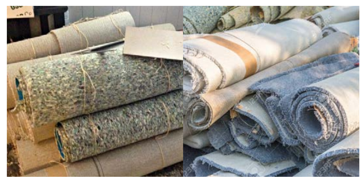
Carpet Site 2: Carpet Recycling

Must be dry, free of tack strips, nails, and other debris, cut into 5' widths, no smaller than 3', backing to the outside, and must be separated from carpet pad. Contaminants on carpet that will designate load as TRASH include paint and drywall mud, body fluids, chemical or pharmaceutical contaminants. Excessive amounts of padding will designate load as TRASH.