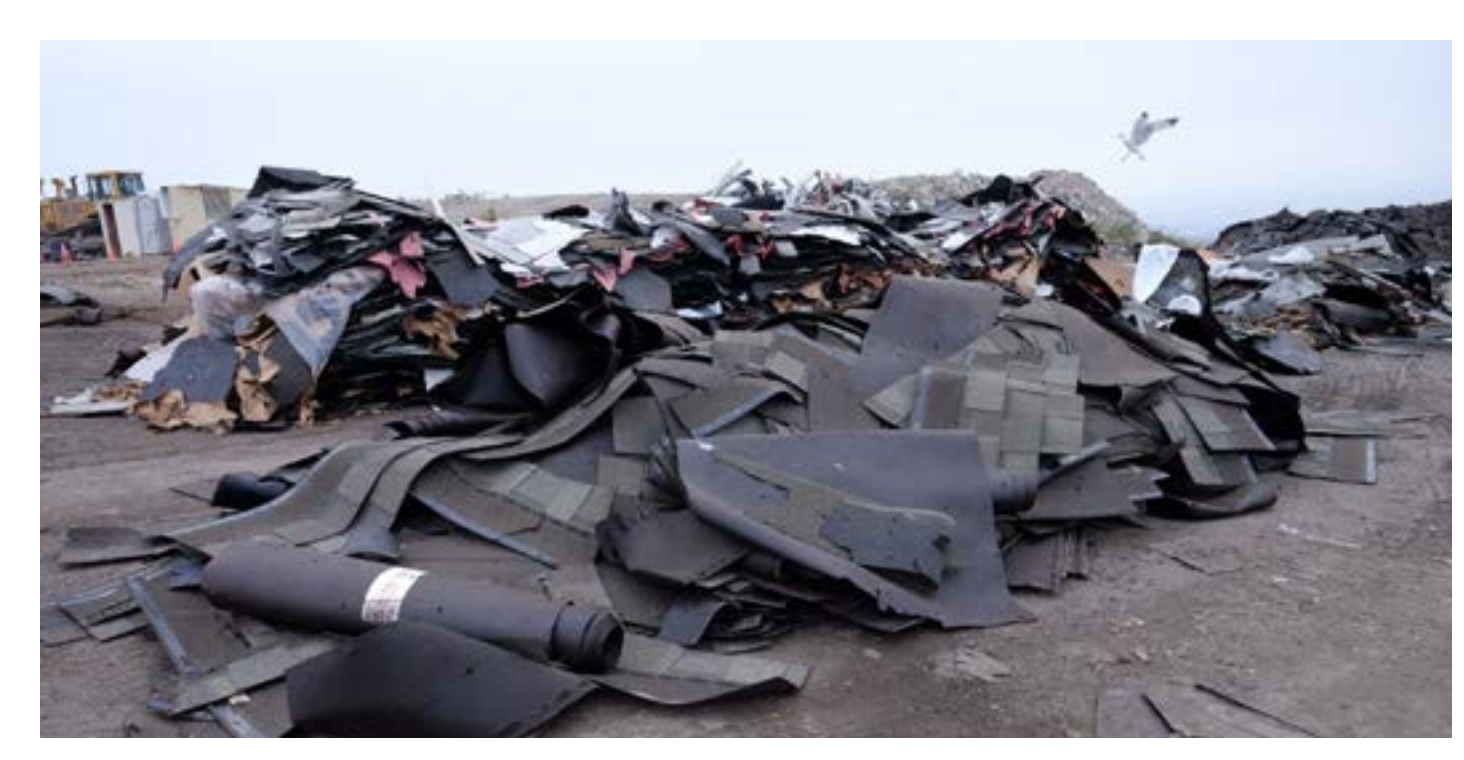
To return to the table of contents, click the logo.

Source separated residential roofing shingles. Does not include tar and gravel roofing or commercial roofing tear-offs. If wood, metals, or bags are commingled in the load, the load will be considered COMPOSITE ASPHALT ROOFING-MIXED.