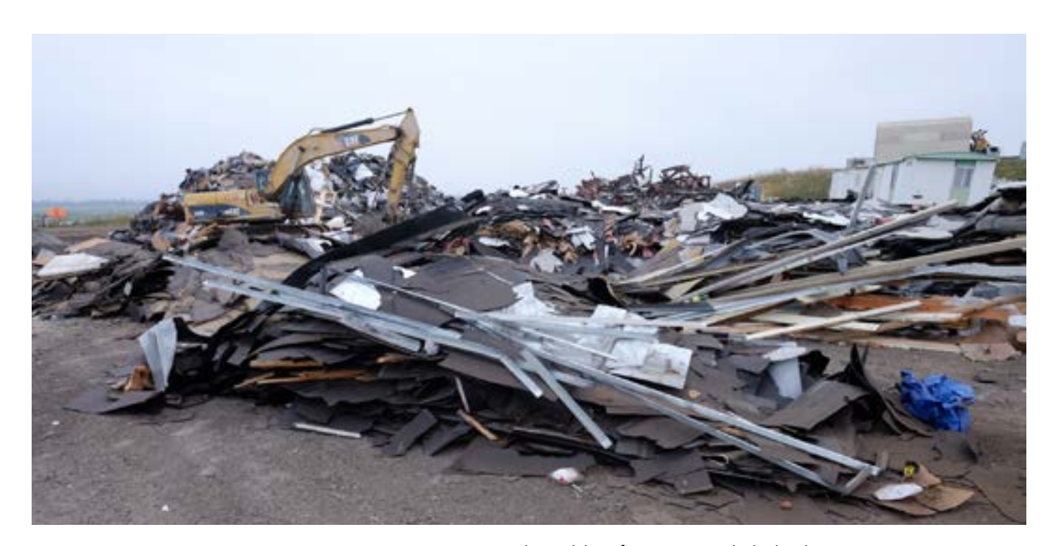
To return to the table of contents, click the logo .

Commercial and residential asphalt roofing containing lumber, flashing, cardboard, insulation, or trash. Wood shingles, trash and insulation may also appear in the load. This material is made into alternative daily cover (ADC).