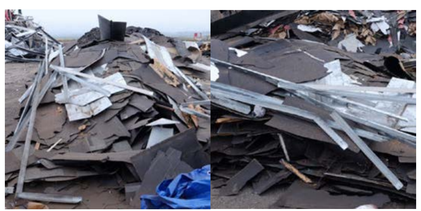
Composite Asphalt Roofing - Mixed Site 1: Asphalt Shingle Recycling

Commercial and residential asphalt roofing containing lumber, flashing, cardboard, insulation, or trash. Wood shingles, trash and insulation may also appear in the load. This material is made into alternative daily cover (ADC).