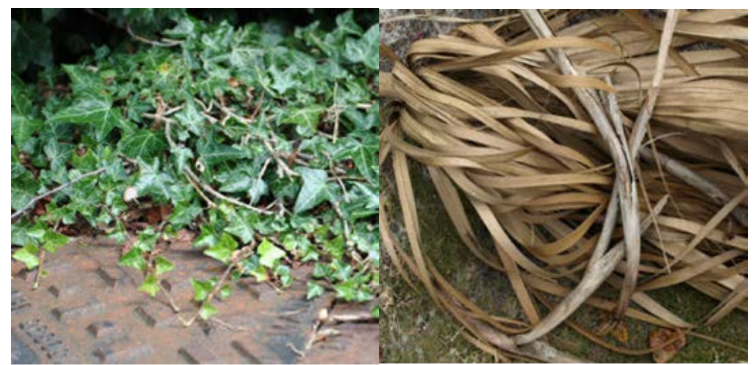
Palm/Ivy/Fibrous Materials Site 1

These items will not be processed. They will be classified as TRASH.