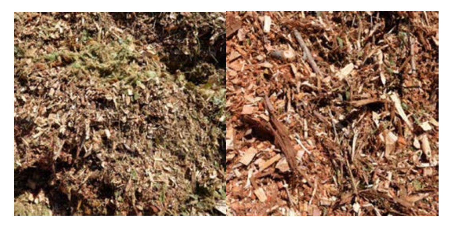
Tree Chips Site 1: Wood Recycling Operation

Tree chips are produced from chipped tree trimmings and may contain a few small tree rounds. No fibrous materials.