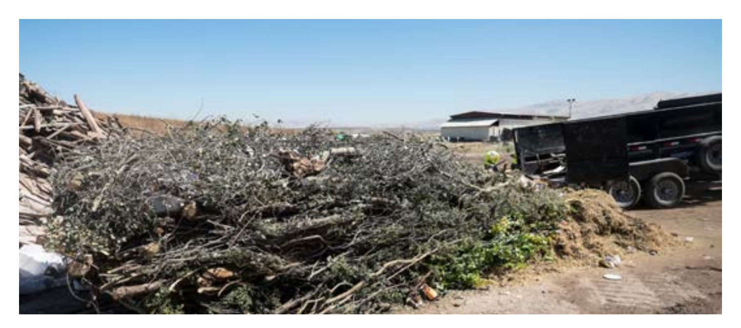
To return to the table of contents, click the logo .

May be classified as TRASH or MISCELLANEOUS DEBRIS if containing excessive amounts of Trash. NON- RECYCLABLE ITEMS (TRASH) may include pressure-treated wood, laminated wood, painted wood, sawdust, insulation, PVC pipes, film plastics and other packing materials, asphalt roofing, roofing felt, roofing insulation, fiberglass insulation, vinyl flooring, ceiling tiles, stucco, soil, asphalt, windows, doors, carpeting, carpet padding, furniture, cabinets, sinks, furniture and Styrofoam, crushed materials, mattresses, rubber tiles, ground rubber materials, textiles and linen, couches, chairs, desks, office partitions, signs, foam board, cabinets, wet materials, Visqueen, composite type materials and or materials contained in trash bags.