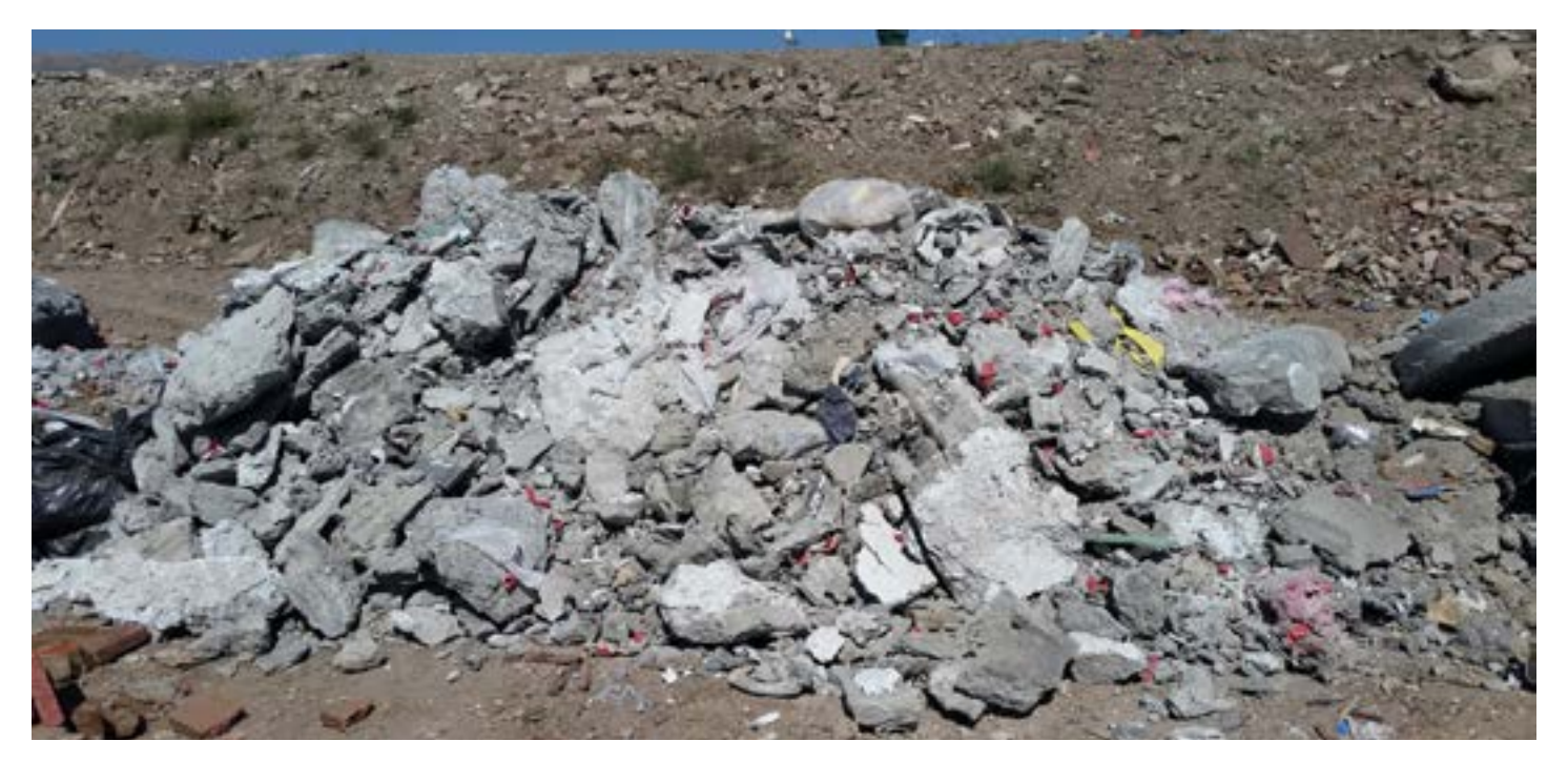
To return to the table of contents, click the logo.

Any load that resembles the images below will be charged as TRASH. Materials will be classified as NON-RECYCLABLE ITEMS (TRASH) if Stucco/Plaster materials are bagged. Excessive trash, wood, etc. in the loads will designate the entire load as TRASH.