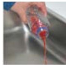
Pour out liquids.