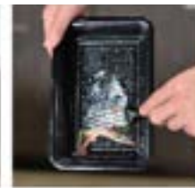
Scrape out food.