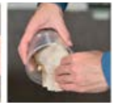
Wipe out oily or sticky residue.