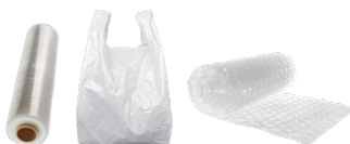
Stretchy Film Plastic Bolsas y Envolturas Plásticas