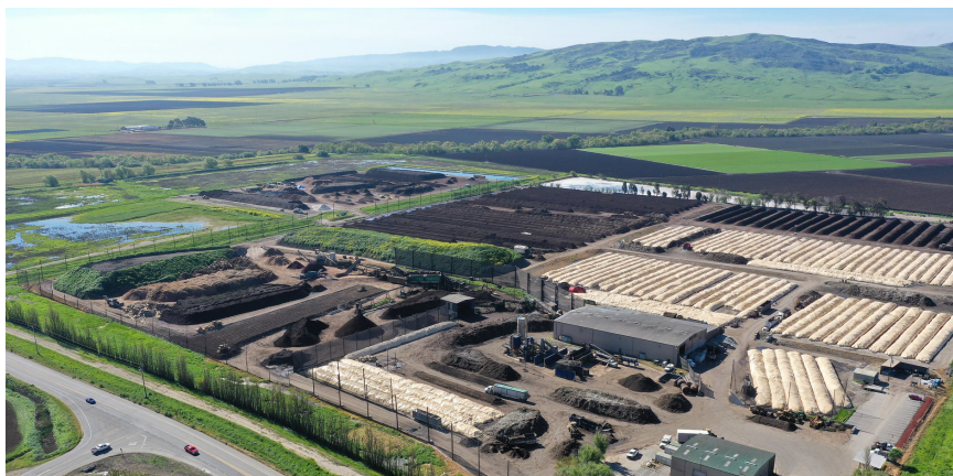
GreenWaste Z-Best Composting Facility in Gilroy, CA.

California Senate Bill 1383 (SB 1383) requires all Californians to divert organic materials from the landfill. Your gray mixed compostables (MC) cart is essential for meeting these requirements and contributing to sustainable waste recovery practices.