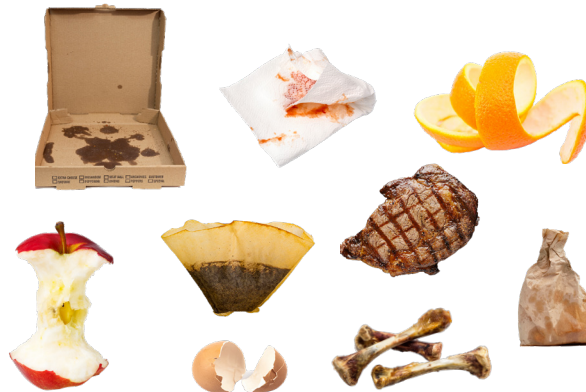
Food Scraps & Food Soiled Paper