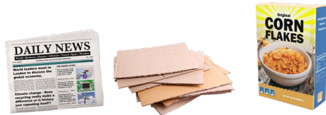
Paper and Cardboard