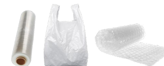
Stretchy Film Plastic Plástico de Elástico Estirable

Do not put these items in your gray cart: