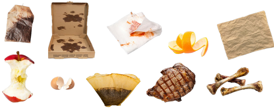
Food Scraps and Food Soiled Paper Desechos de Comida y Papel Manchado con Comida