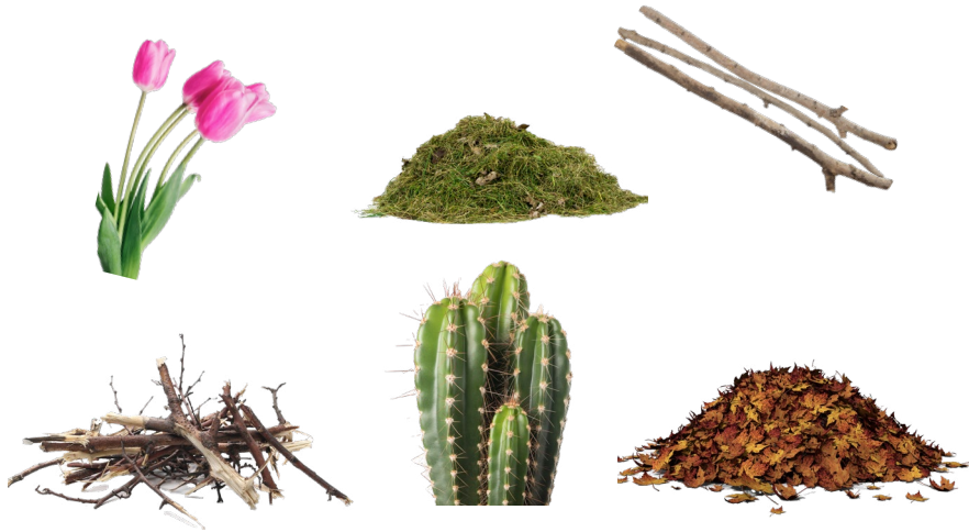
Yard Trimmings Recortes de Jardín