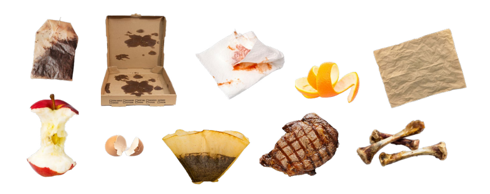
Food Scraps and Food Soiled Paper Comida y Papel Manchado de Comida