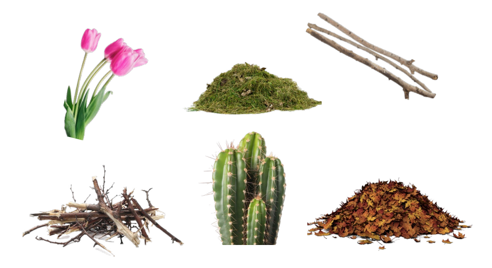
Yard Trimmings Recortes de Jardín

Note: If you do not have a green cart, place all yard trimming material in your gray cart.