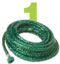
1 Hoses are recyclable.

Do you ever have trouble determining whether an item is recyclable or not? Here are 6 confusing items that have stumped many, and are often found in the wrong container. Help us manage your materials efficiently by placing these items in the correct container.