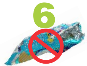
6 Chip bags are NOT recyclable.