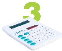
3 Calculators are recyclable.