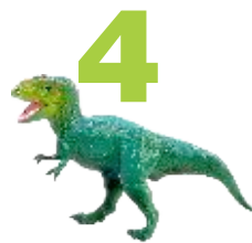
4 Plastic toys are recyclable.