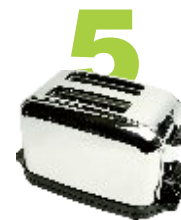
5 Toasters are recyclable.