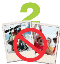
2 Polaroids are NOT recyclable.